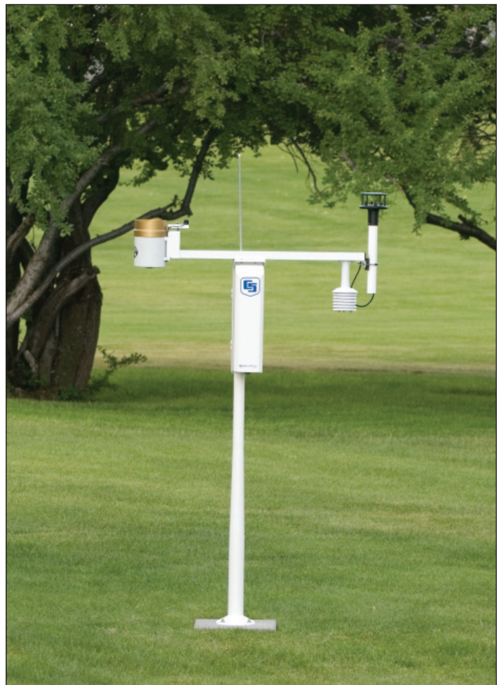
The ET107 provides real-time weather measurements and calculates ET_0 on an hourly and daily basis.

Digital cellular phones, spread spectrum radios, and voice synthesized modems may be used for some applications; contact Campbell Scientific for more information.